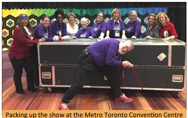
Packing up the show at the Metro Toronto Convention Centre