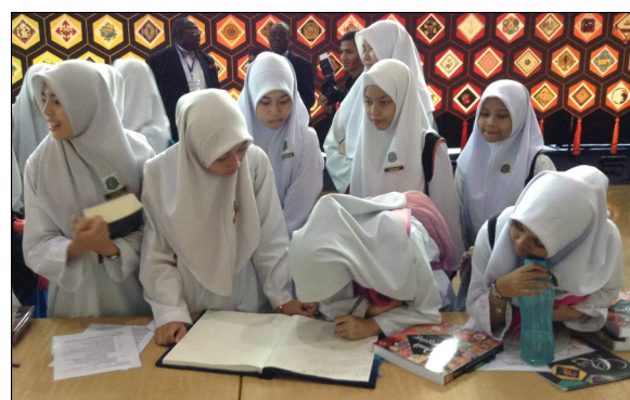
Students in Malaysia