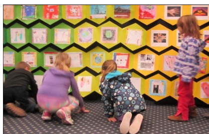
There's my block! Cornwall, Ontario