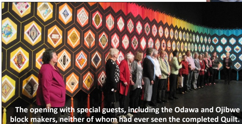
The opening with special guests, including the Odawa and Ojibwe block makers, neither of whom had ever seen the completed Quilt.

"Everyone is talking about the Quilt in Manitoulin—in the grocery store, the hardware shop, in every church, on the sidewalks. That we got to have this amazing piece of art here is a miracle."