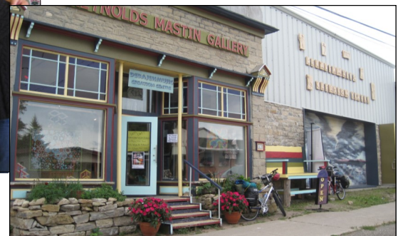
The innovative Debajehmujig Creation Centre, formerly the old general store in Manitowaning